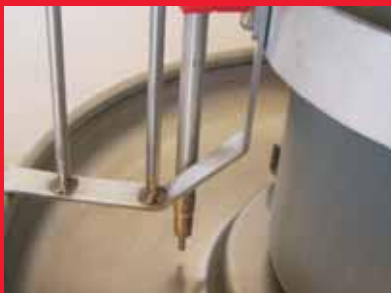
2 nipple drinkers