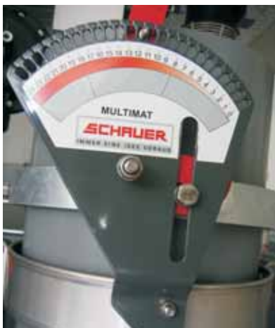
Incremental adjustment with 24 positions for easy operation