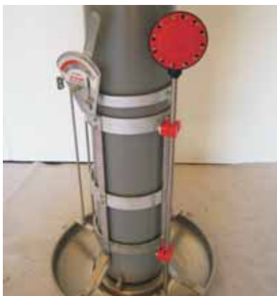
With aqua level feeder